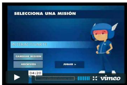
Figure: 5 Section Resource Material

With each theme of the seminar a number of proposed activities was formulated, e.g. prepare for the next videoconference with the proposed readings or create an avatar en SL and meet your co-students to get a sense of immersion into virtual worlds. Furthermore a specific forum was established for the discussion of each theme. Also the invited experts and the tutor were participating in these forums.