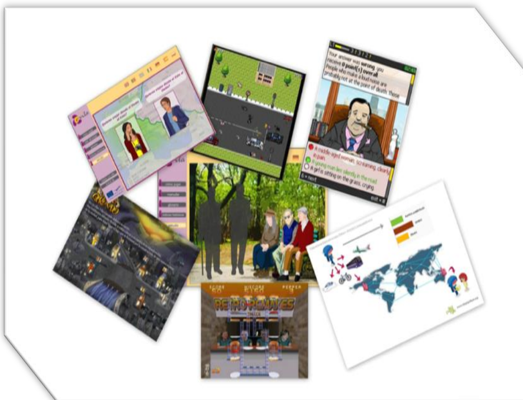
Figure: 7 Serious games used

The multimedia resources and the educational games formed the backbone of the seminar. We used some freely available games from the internet to be studied as examples in addition to the games developed by the invited experts themselves. The fact that the experts could describe and comment their own developments was beneficial for a critical and in depth discussion of the "making of". As an introduction to the game world – for many of the participants a relatively unknown field – we asked them to play and analyze the simple games Pong and BurgerLand . Games developed by the experts in the framework of their proper development teams were among others Urgente Mensaje , Villa Gironde , Fastest First , MOGABAL , Bloque del Este/Oeste , Turismo , Trabajo , Ocio .