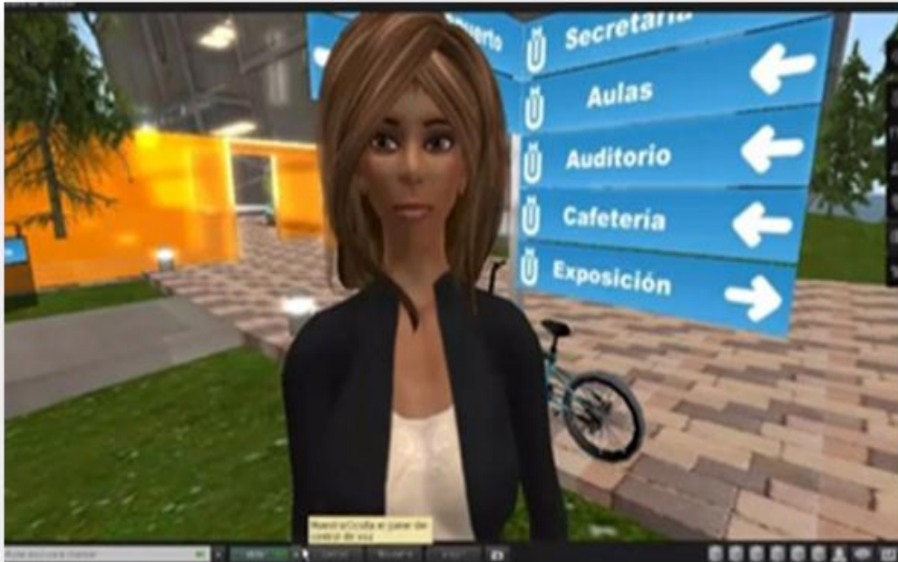
Figure: 8 Videotutorial in Second Life

He demonstrated interesting applications as part of Second Life such as an immersive tour into a fuel cell and a game based learning installation that used a ground penetrating radar to detect environmental waste.