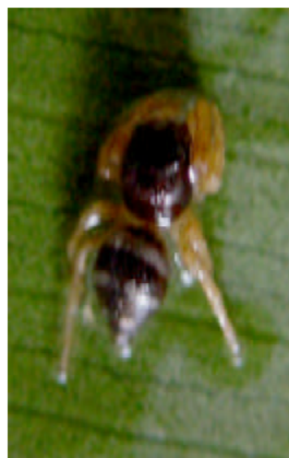
Fig. 2: Salticus scenicus (Clerk, 1757) (Original figure, Ghavami et al. , 2003)