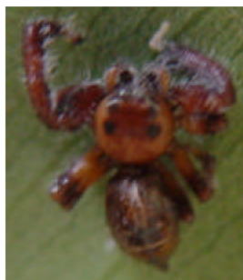
Fig. 3: Thyene imperialis (Rossi, 1846) (Original figure, Ghavami, 2002)

Frontinellina fruntetorum (Linyphidae) Fig. 5, Thyene imperialis Fig. 3, Salticus scenicus (Salticidae) Fig. 2 and Thomisus onustus (Thomisidae) (Fig. 4), identified as dominant species. The population of F. fruntetorum was the most in all months between May to October (33.33, 35.29, 41.66, 56.25, 62.5 and 82.56%, respectively) and T. onustus the lowest (Table 2). The population of T. imperialis and S. scenicus was the most in Zanjan olive orchards. The most population of T. onustus was found in Ghazvin olive orchards. F. fruntetorum were found on all branches olive trees. They webbed on all of branches. The mostly population were found in down and middle of olive trees. T. imperialis were seen on middle and S. scenicus were showed on all high and middle branches of olive trees, especially on head of the tree. T. onustus were found on down and middle branches, especially on the point of branches.